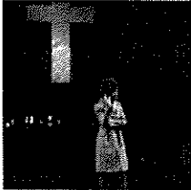
"This Beautiful City" City"

Want to re-live Ted Haggard's fall from grace at New Life Church? Or hear bouncy songs on how Colorado Springs became the evangelical capital of America? Are you curious how conservative Christians' condemnation of same-sex attraction affects the lives of gays and transgendered people? Then you might want to read my story on the musical "This Beautiful running Friday, Dec. 11, at gazette.com in the entertainment section. The musical examines the evangelical movement in Colorado Springs by using the exact words of evangelical and liberal residents interviewed in 2007.